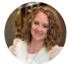
Crystal Creekmore Human Resources