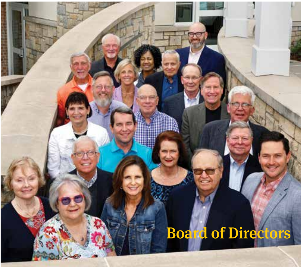
Board of Directors