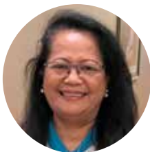
Rosal Osburn Holliman Center