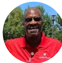
Clarence Elliott Transportation