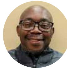
Japhari Maji Health Center