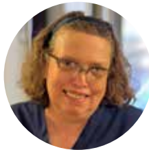
Harriet Zavala Health Center