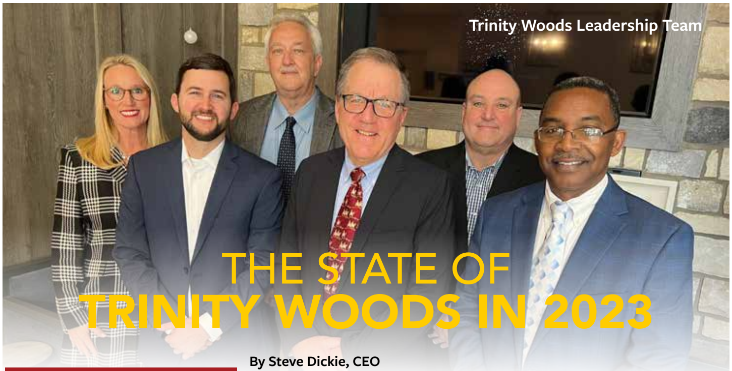
Trinity Woods Leadership Team

The neighborhood news from Trinity Woods | Issue: January 2023