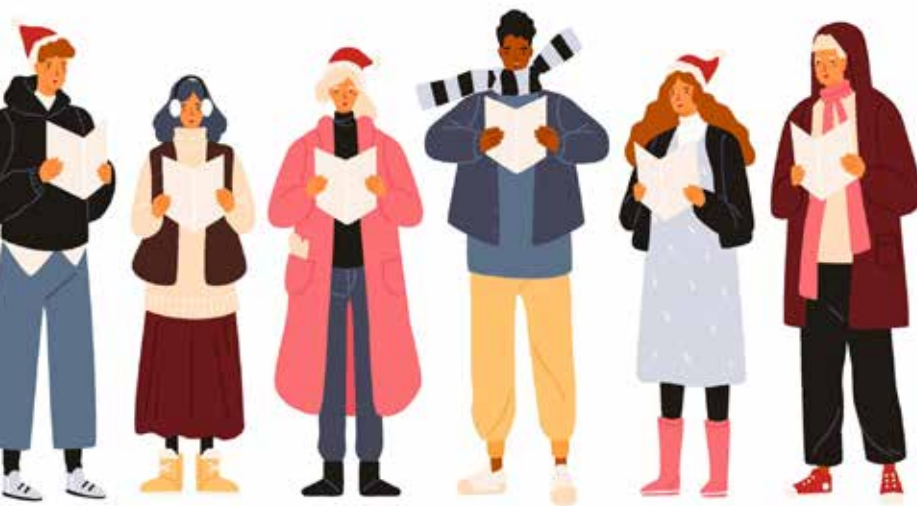
Christmas Sing-Along with the Trinity Woods Chorus Thursday, December 29 at 7 p.m. Community Life Center, Westervelt Hall Refreshments to follow. No reservations necessary.

Some of the youngest students of Regent Preparatory Christian School will be here to perform for us. Come and share the special delight of little children at this wonderful time of year as they share Christmas music with us.