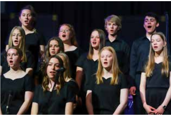
Regent Preparatory School Choir & Band Christmas Program Wednesday, December 7 at 10 a.m. Community Life Center, Westervelt Hall No reservations necessary.

Come enjoy young people from throughout Tulsa who are creating community through music. The Sistema choir and a string and woodwind ensemble will present a Christmas program just for us. Since 2015, Sistema Tulsa has offered rigorous and high-quality music learning programs that are free of charge and accessible to all. Sistema's mission is "to nurture community and improve young people's lives through the practice of music." What a marvelous way to celebrate the season!