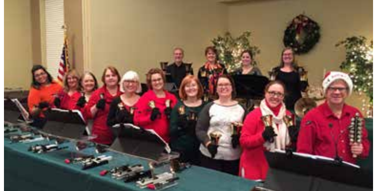
University United Methodist Church Wesleyan Handbells Concert Tuesday, December 13 at 7 p.m. Community Life Center, Westervelt Hall No reservations necessary.

Our stage will be filled with talented young people as first, the band, and then the middle school choir followed by the high school choir from the interdenominational, classical, Christian Regent Preparatory School present a beautiful Christmas program for us. Don't miss this inspiring performance.