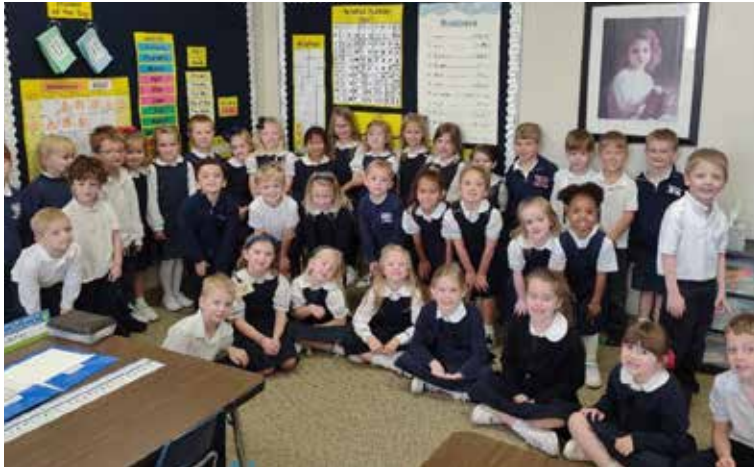
Regent Prep Pre-K Christmas Program Monday, December 19 at 10 a.m. Fleming Center No reservations necessary.

Some of the youngest students of Regent Preparatory Christian School will be here to perform for us. Come and share the special delight of little children at this wonderful time of year as they share Christmas music with us.