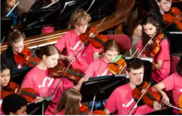
Sistema Tulsa Christmas Concert Saturday, December 3 at 10 a.m. Fleming Center No reservations necessary.

Come enjoy young people from throughout Tulsa who are creating community through music. The Sistema choir and a string and woodwind ensemble will present a Christmas program just for us. Since 2015, Sistema Tulsa has offered rigorous and high-quality music learning programs that are free of charge and accessible to all. Sistema's mission is "to nurture community and improve young people's lives through the practice of music." What a marvelous way to celebrate the season!